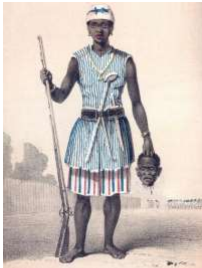
One of Agojie women warriors, with a musket, club, dagger—and her enemy's severed head.

https://www.smithsonianmag.com/videos/this-african-warrior-ceremony-was-highly-intim/