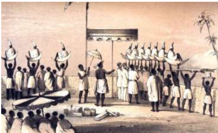
Dahomey male and female recruits throwing bound and gagged African prisoners of war over a wall to their death.

In the movie, Nanisca had to bury those brutal memories, which is why she is a survivor and tough leader without emotion in the film. The historical Agojie were married to the king and had to adhere to a strict code, where they were not allowed to marry, have children, or have sexual relations with men. Disobedience was punishable by death. Motherhood and caring would apparently make these female warriors less fierce. The Agojie went through a brutal training regimen, and insensitivity training was a core element of this process. Not only were they required to undergo difficult physical drills such as weapons training, hand-to-hand combat, and climbing through acacia thorns, but also how to decapitate someone with a few blows of the sword, and practice lifting and throwing bound captives off the top of buildings. For instance, new military recruits of both genders were required to mount a platform, pick up baskets containing bound and gagged African prisoners of war, and hurl them over the roof wall to their death, while there would be a frenzied mob below.