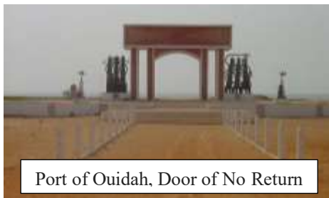
Port of Ouidah, Door of No Return

A final issue rarely discussed in these social media debates is that the promotion of " The Woman King " effectively undermines the global reparations movement and the African American claims to reparations for slavery . The reparations movement has gained momentum in recent years, and one of its core positions is that continental Africans were not responsible for slavery and the slave trade. However, "The Woman King" contradicts this position and will harden attitudes in opposition to this assertion, as the advocates of this film approve of the Agojie actions within the Dahomey slave-trading empire, simply because the movie softens these bloody crimes and places African women as the central characters and heroes.