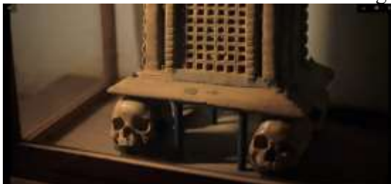
Throne of Dahomey King Ghezo, in the Historical Museum of Abomey.

For example, in one falsified scene, King Ghezo’s royal throne was shown to indicate his authority, but it did not depict the fact that the legs of this throne literally sit on top of four skulls of decapitated conquered enemies . This was a careful manipulation of facts designed to sanitize the Dahomey brutality, and this visual misrepresentation passed over the heads of most unsuspecting viewers. Here is the actual throne of King Ghezo resting on the skulls of his African victims: