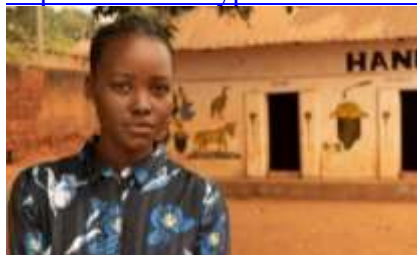
Lupita Nyong’o in Benin (left).