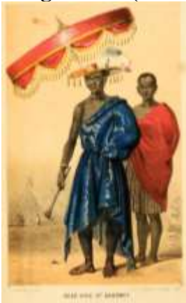
King Ghezo in 1851.

At the end of the movie, the audience is given a moral feel-good victory when General Nanisca succeeds in convincing King Ghezo that he should end the slave trade and replace this blood revenue with money from the palm-oil trade. He finally agrees with the wisdom of her words, and then makes her “The Woman King.” This is a very nice Hollywood ending, but there is no record of a “woman king” in Dahomey and unfortunately King Ghezo never stopped his slave trading.