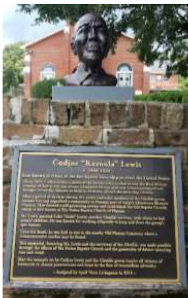
Bust of Kossola Cudjoe Lewis in front of the Union Baptist Church, of which he was a cofounder. Abache (Clara Turner) and Lewis pictured c. 1912, and they were among less than 10 remaining Clotilda survivors at the time.