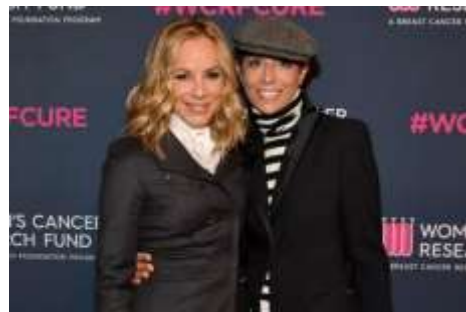
Maria Bello (left) with her fiancé Dominique Crenn shortly after these women announced their engagement in 2020. Right photo.