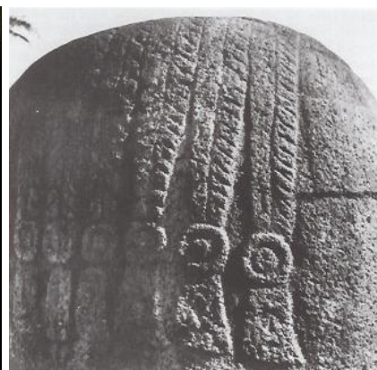
Africoid hairstyle with braided hair